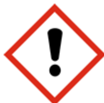
Harmful / Irritant