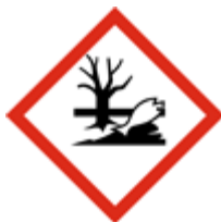
Dangerous for the environment